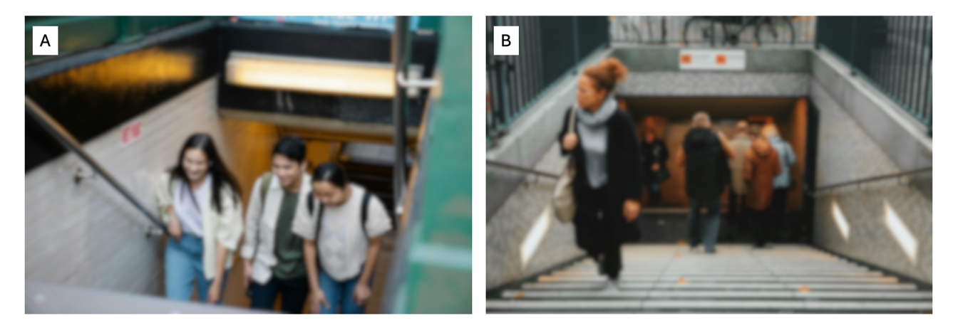
Note. The images have not been used in the actual study. Panel A: The picture shows a group of people high in entitativity, representing an intimacy group (friends). Panel B: The picture shows a group of people low in entitativity, representing a transitory group (strangers). The pictures have been resized and blurred to reduce the influence of emotional facial expressions, attractiveness, and other potential biases.

Symbolic Pictures Representing the Two Types of Social Groups